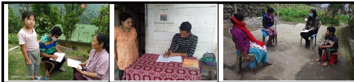
Staff, SMC members and volunteers compiling data for students tracking

Some parents and SMC members volunteered to conduct student tracking during school closure. They visited the residence of the students who were not able to attend virtual classes or another alternative mode of teaching-learning, inquired about their problems, and tried to solve their issues. This has also helped to keep a check on the dropout by students due to prolonged school closure.